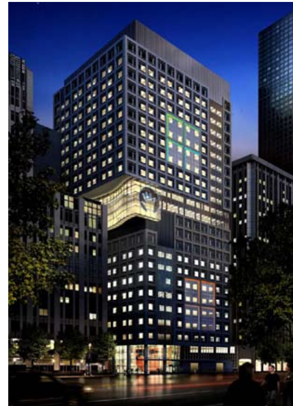
Ann & Robert H. Lurie Children's Hospital of Chicago